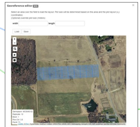
Georeference editor widget

If you are already using BMS Pro within your organization, the IBP Deployment Manager assigned to your server instance will be in contact with you to upgrade to the latest version. Otherwise, BMS Pro is available upon request. Contact us for a guided demo: www.bmspro.io